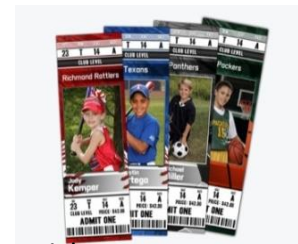
Ticket Magnet or Poster